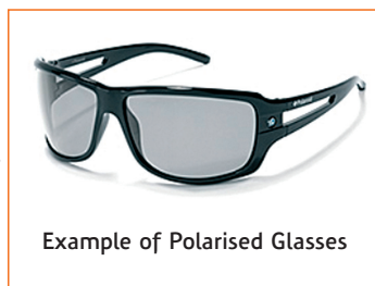
Example of Polarised Glasses

Polarized 3D glasses come in two forms, linear polarized and circular polarized. Linear polarized glasses require the user to maintain a vertical head position. Tilting the head, left or right, can break the 3D effect because the content relies