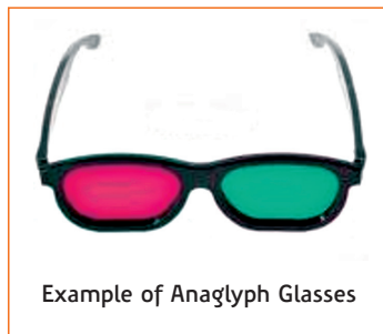
Example of Anaglyph Glasses

Anaglyph glasses are most commonly seen with one red and one green lens. They are the least advanced of all methods of delivering 3D and because they use colour to separate the images, some or all colour information is lost to the viewer, so are rarely used now.